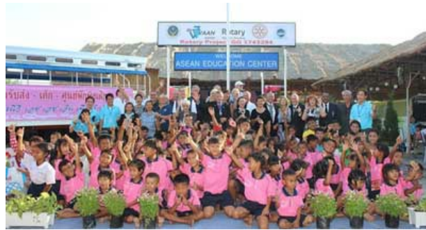
The children join the sponsors, Rotarians and teachers for a group photo.

Eventually the migrant children will return to their home countries. In the meantime, the ASEAN Education Center will provide them education to ensure a better future. 100 is a drop in the ocean but it's a start, and without the work of NGO's such as HHN and Rotary and generous benefactors, the children would be running about the streets of Pattaya and perhaps turning to a life of crime.